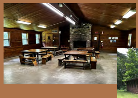
Visit rjrd.recdesk.com for rates, details, and to reserve

We anticipate that Amity House will be available for rental in Autumn 2024.