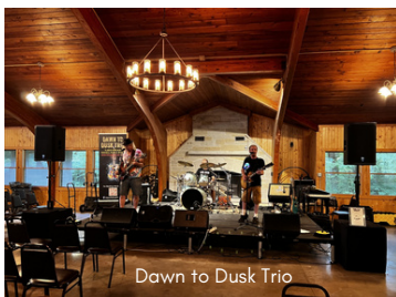
Dawn to Dusk Trio