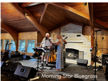
Morning Star Bluegrass